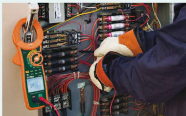
Test leads included for Multimeter functions