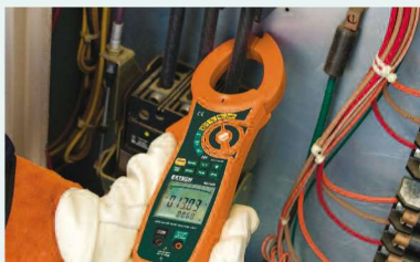
2.0" (52mm) jaw size for conductors up to 500MCM